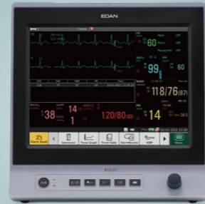
X VET Series Veterinary Monitor