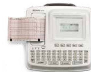
SE-601A (3.5" Monochrome LCD Display)