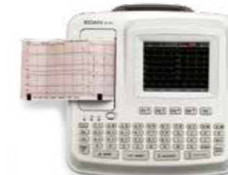
SE-601B (5.6" Color LCD Display)