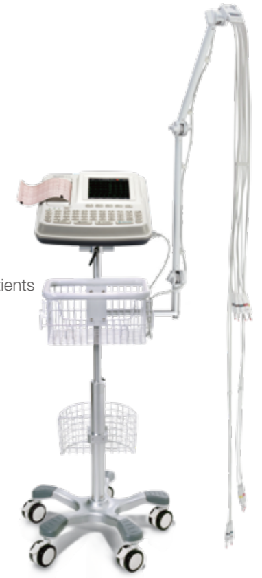
SE-601C With Rolling Stand (5.6" Color Touch Screen)